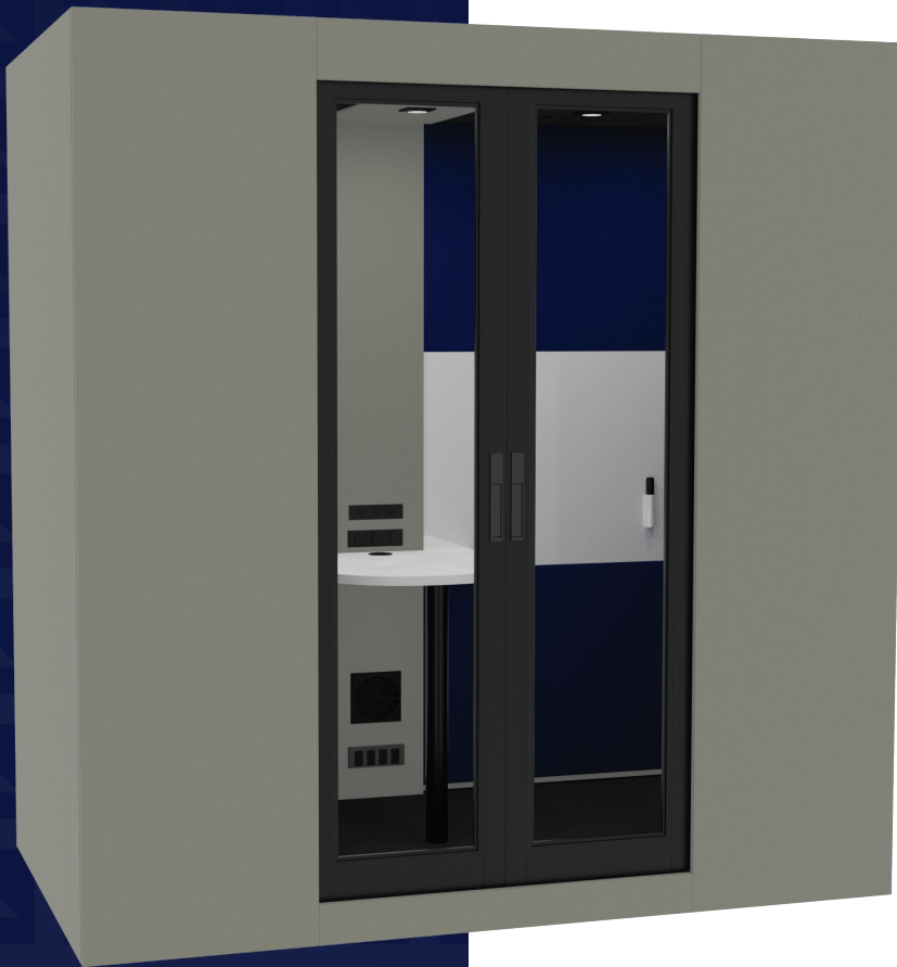
Shown in Fog Gray Laminate and Cobalt Felt

For additional information contact your local dealer or the smartBOX company: