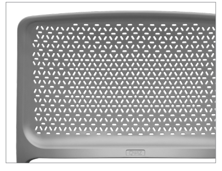
Maximum breathability + comfort